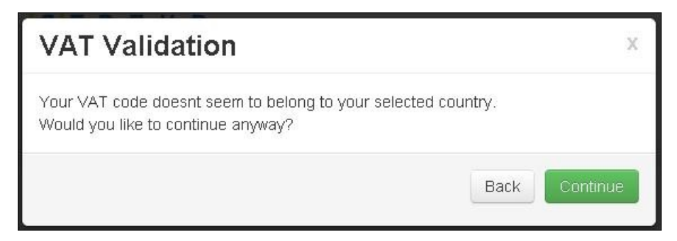
Figure 18 – Error in VAT code validation

After entering Section 1, click the " Next " button to go to Section 2. If the entered VAT code prefix does not match the selected country, the following popup message will be displayed: