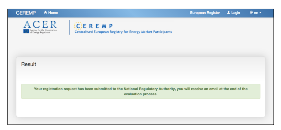
Figure 5 – Notification message