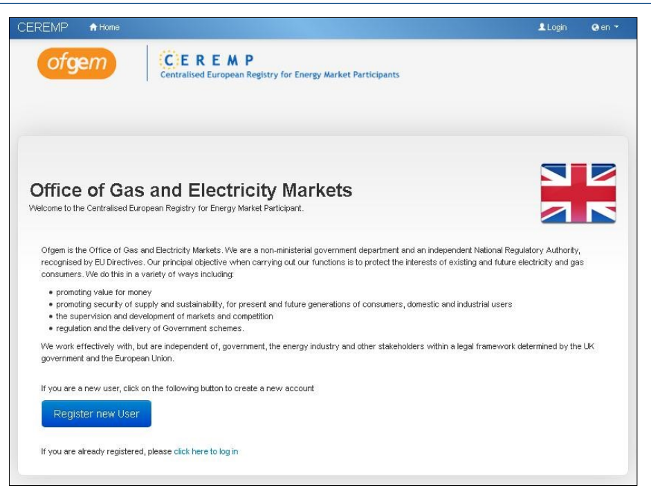
Figure 1 – An NRA home page (here: OFGEM)

• Before starting the registration process, you can manually choose your preferred language from the list of available languages. Default language is English.