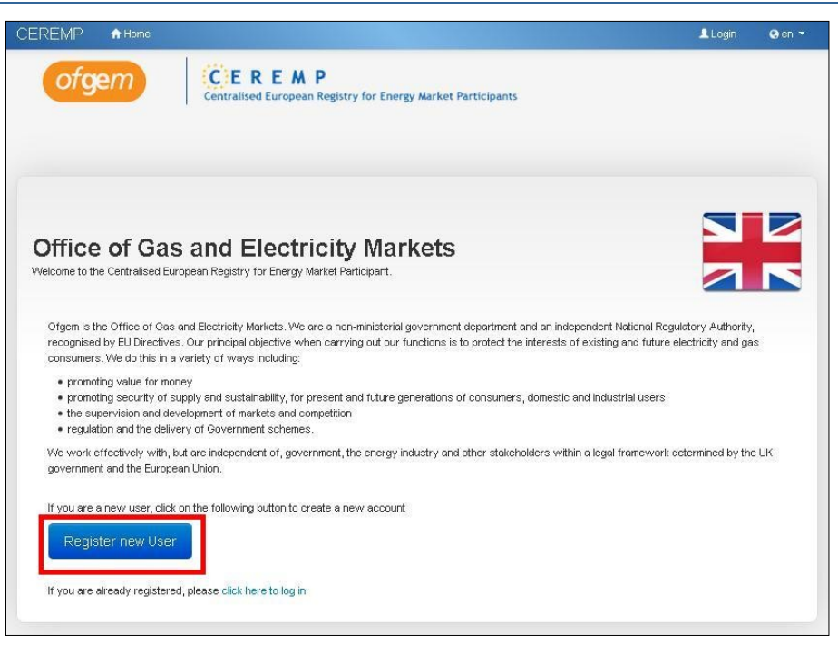
Figure 3 – Register New User

• The page which allows you to enter details concerning the "Authorised Signatory" of the organisation is displayed.